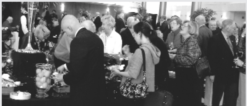
Platinum Gala Reception